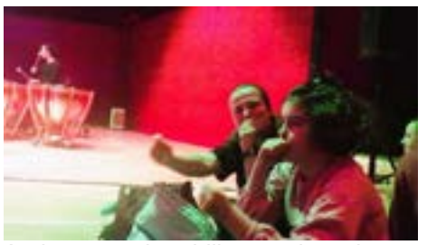
A trip to see the philharmonic orchestra.