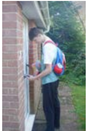
Transitions and work-related learning are preparing our young people for their adult life.