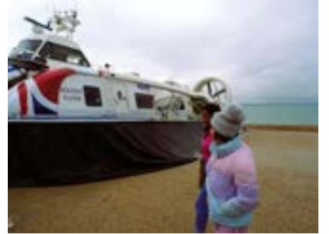
A small group of students travelled over to the Isle of Wight on the Hovercraft