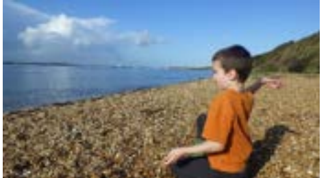
A trip to the coast, walks ,boat spotting and stone skimming.