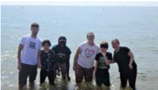
Seaside day trip

Our PLLUSS curriculum is all about learning through experience and in the summer, we have once again been able to explore so many new locations and experience new things. These trips help with all aspects of our curriculum, new language (communication), exploring and discovering new things (access to learning), traveling to new places and used different types of public transport (transitions) plenty of independence skills and relating and interacting with new people. We have also had so much fun with our learning experiences, engaging with new things and different leisure activities. I delight in seeing how our young people cope so well with so many different things it is testament to how they are learning and implementing so many skills that they will use in adulthood. A great final term to what has been a highly successful academic year for Loddon. Well done staff and students.