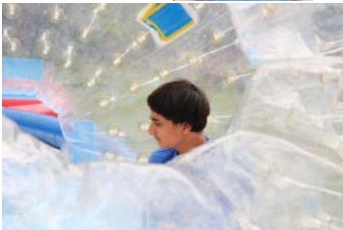
The inflatables and ice cream van were a success!