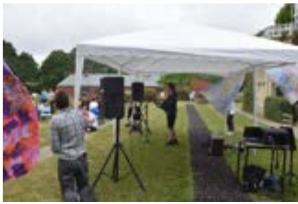
Wildmoor music festival – invited schools brought their musicians to play – thanks Portfield School.