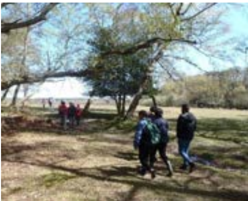
New Forest walks