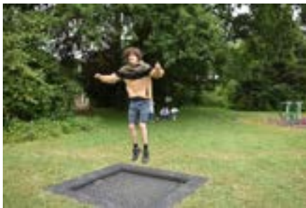
Enjoying the grounds while listening to the music festival and experiencing over 100 people on our school field – great achievements all round.