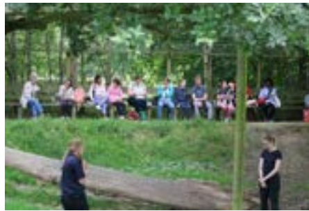
British Nature Park