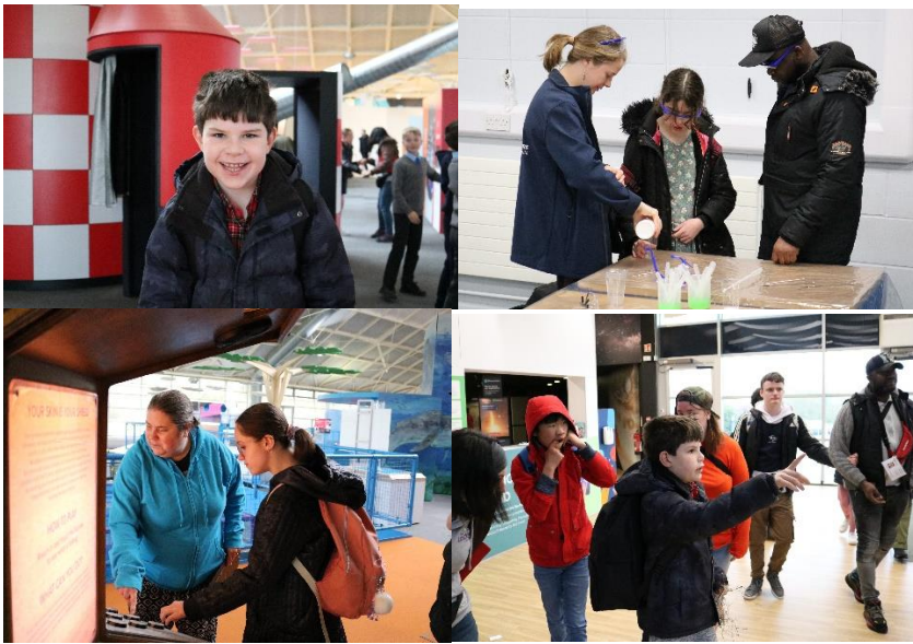
Above pictures taken during visit to Winchester Science Museum