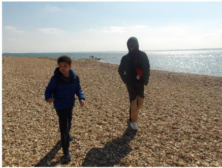
Trip to the beach