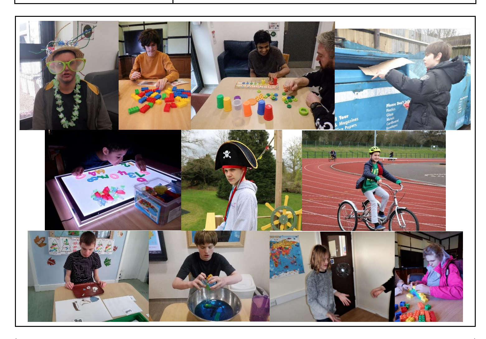
Our term packed full of learning, new experiences, and opportunities

If you are visiting use lateral flow tests while you have them but once they have gone only visit if you are fit and well. If we all maintain high levels of preventive practice, we should all keep healthy.