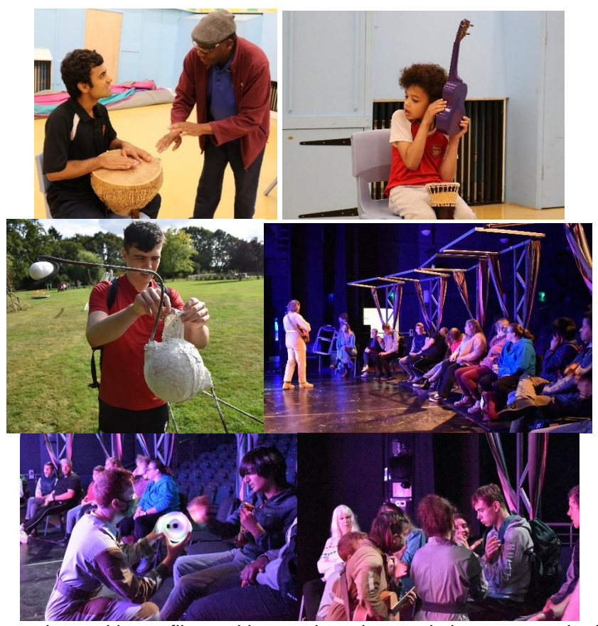
We continue with our film making work and recently have created a film for The Schools Shakespeare Festival – we will release times for you to watch on the web as we are told nearer the time.