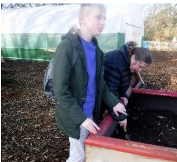
In front of our new polytunnel