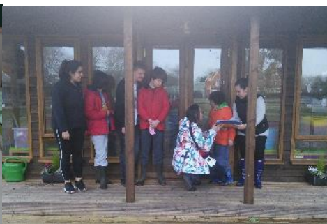
Storytelling Week activity