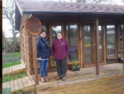
Our Outdoor Hub and Staff