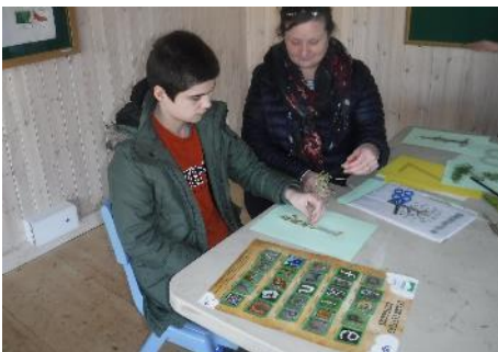
Literacy in the outdoor Hub

Now, as a Forest School Provider and a Trailblazer school we have even more reason to find so many more ways to make learning outdoors fun. The new Outdoor Hub, which stands next to the polytunnel is getting plenty of use and it is lovely to see how this extra space is allowing shared working. Whole house groups are now working on learning tasks together as you can see below.