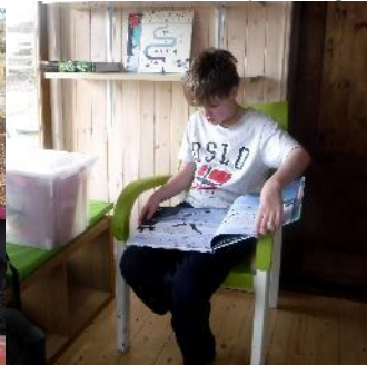
Reading in the Hub