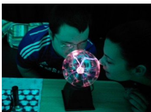
Exploring and discovering with our many light and sensory toys

https://www.justgiving.com/fundraising/LoddonLoons