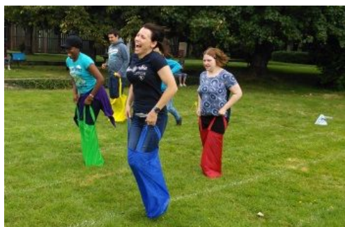
Team races on the school race track.