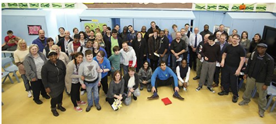
Our weekly star assembly—some students and staff able to join in our school photo.

In order to maintain high standards of care at the school we teach the National Children’s Workforce Diploma, & Residential Childcare Diploma to all care staff. Our Standards Verification Assessment this week, that lasted from 10am to 5pm, gave us the status to award the qualification and stated that our standards were exemplary and we offered an outstanding quality and range and training for all staff.