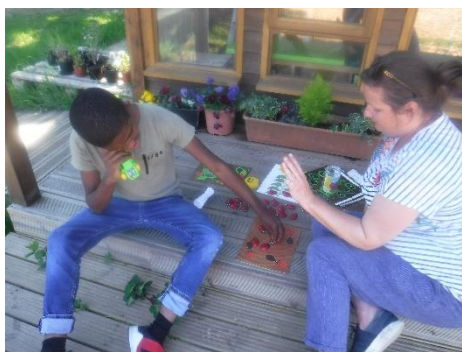
Creating number patterns and finding numbers using ladybird counters.

The children have been able to continue to ride over the past months, and Annie is now very happy in her new paddocks. We have also purchased a new tricycle and this week we are also purchasing a new cradle swing and in-ground trampoline for the back field, thanks to some wonderful donations. Replacing the trim trail and the climbing frame.