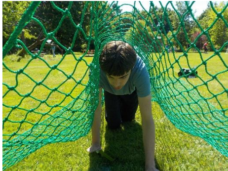
Exploring the concepts of over and under using physical activity.