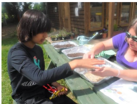
Our planting and growing has developed greatly as we use our new polytunnel for vegetables.

The new polytunnel has a number of raised beds in which we have been planting a variety of vegetables and soft fruits. We hope to use these in our cooking sessions later in the year.