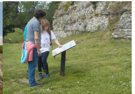
Silchester, along the Roman Wall is a favourite walking spot for us all.