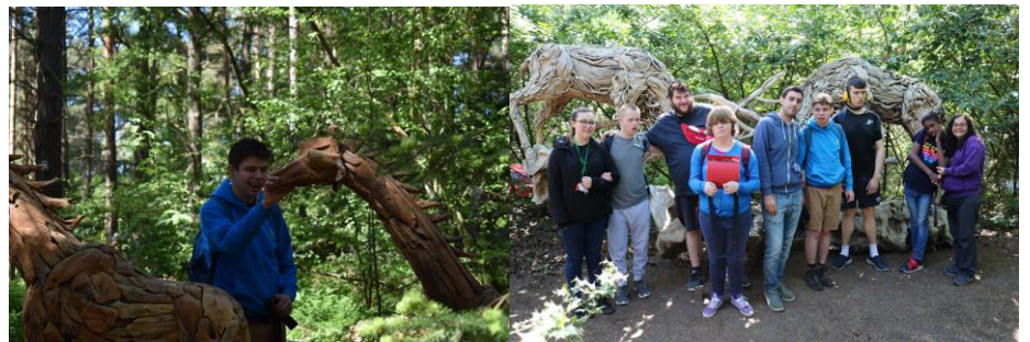
A group visited the outdoor Sculpture Park in Chichester, which was displaying a variety of exhibits made from recycled materials.