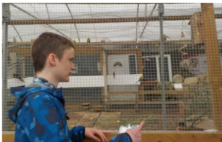
A group visited the Butterfly farm in Swindon.

The themed curriculum this term of 'Looking After our Planet' has allowed us to visit a number of linked sites to explore and learn.