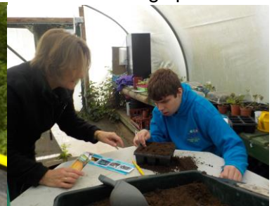
Our Occupational Therapist and Speech & Language Therapist have been able to link in with many of our activities building skills in situ.

Hope to see you at the Music Festival (28th June) or Sport's Day (19th July)