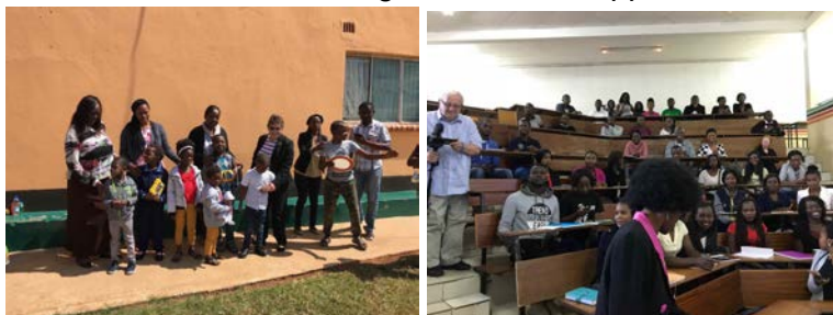
Photos taken after a parent support meeting and a lecture.